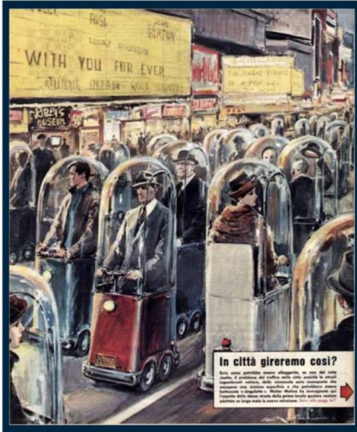
World in 2022

An illustration from a 1962 Italian magazine shows an imagined scene from the year 2022.